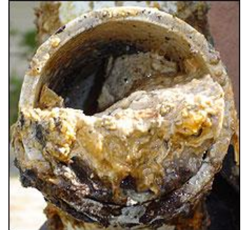
Sewer line inundated with grease